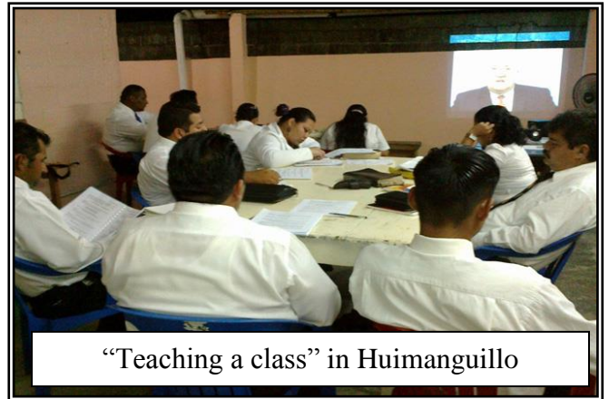
"Teaching a class" in Huimanguillo

RECORDING: I just finished re-recording the Baptist History course for the Bible College. I did an extensive amount of research and put together a course that I feel will be even more beneficial to our students than the previous course had been. Through the course of history great men sacrificed and even laid down their lives to preserve the truths that we hold so dear; I want to make sure that our students know and appreciate how much they did for us.